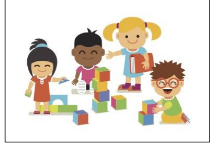
We Play to Learn & Grow